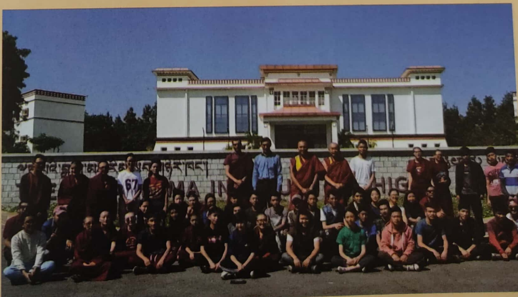
Educational Tour 2019-20