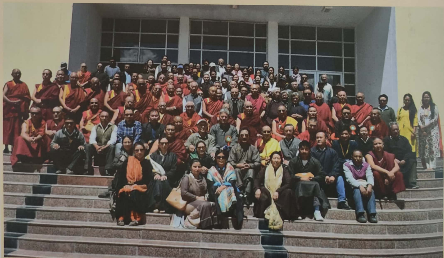
Group Photo during Seminar on Gelugpa Tradition