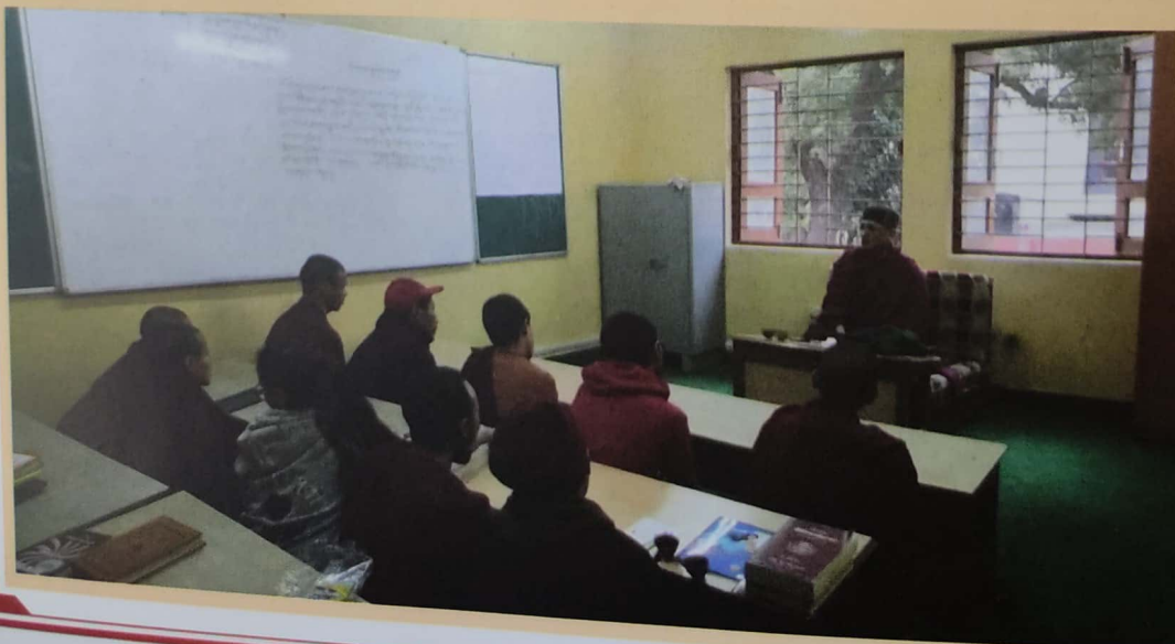
Students Exchange Programme 2019-20