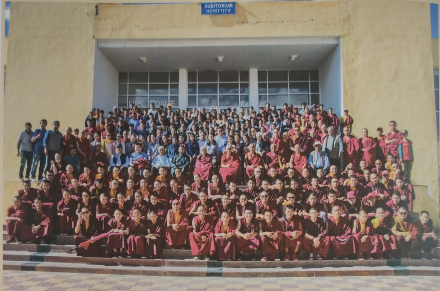
Group Photo during Annual Memorial Lecture Series of H.E. Gyalsras Bakula Rinpoche