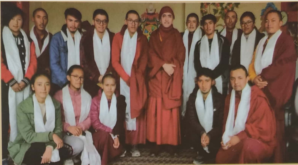
Director with New Executive Members of Students Welfare Committee